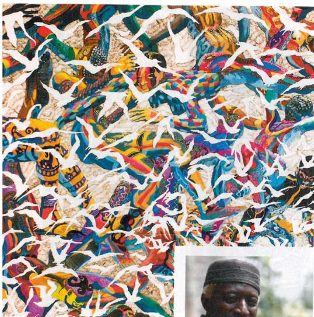
"Those on High", which pictures Egungun spirits floating above humans