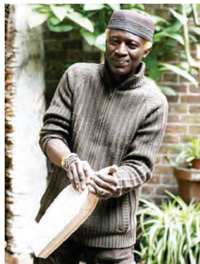
The artist at work