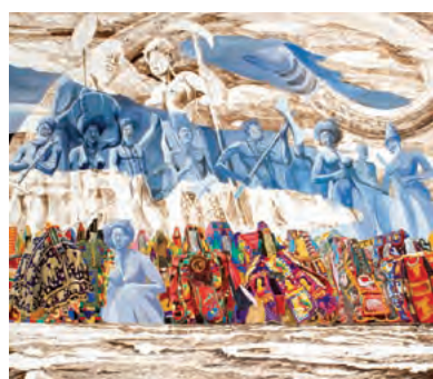
'Those of Life'

'SPIRIT WORLDS' FOCUSES ON THE RETURN OF THE SPIRIT OF THE ENSLAVED AFRICAN ANCESTORS AND THE METAPHYSICAL SIGNIFICANCE OF THE 'TRANS-MIGRATION OF THE AFRICAN SOUL'