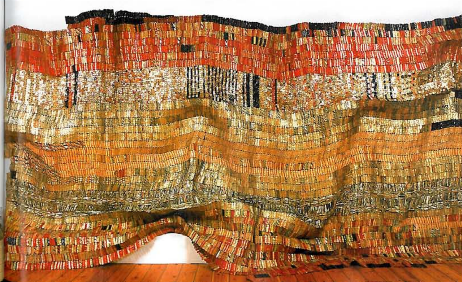
Clockwise from top left: El Anatsui; his 2007 work Fresh and Fading Memories, Part I-IV ; Fading Cloth from 2005; 2003's Wastepaper Bag . Previous page: El Anatsui's Flag for a New World Power , from 2004

your imagination. I have found it's a very good way, whereby ideas or works feed off each other.